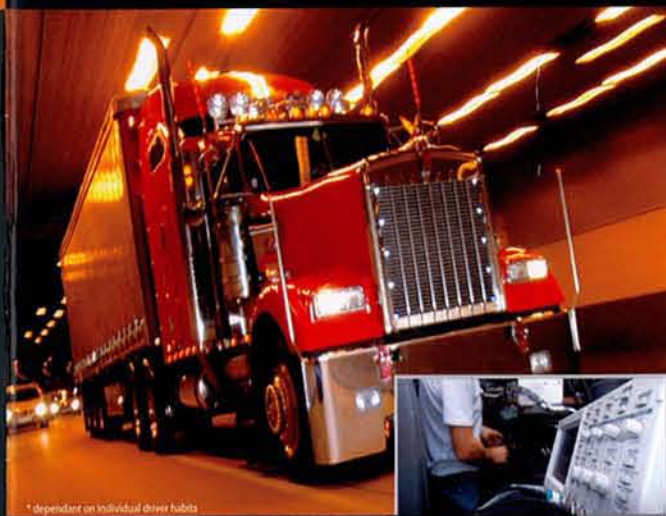
* dependant on individual driver habits