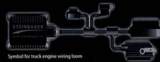
Symbol for truck engine wiring loom